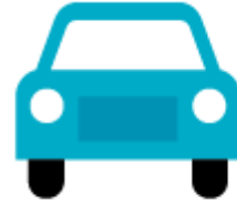
Travel to work for essential jobs.

Stay home stay healthy applies to all people except those performing essential jobs like: