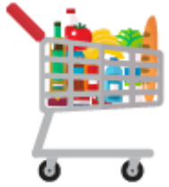
Food and household supplies.

You must stay home except for supplies and services like: