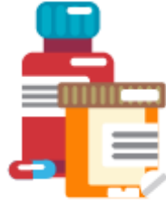
Medicine or medical care.