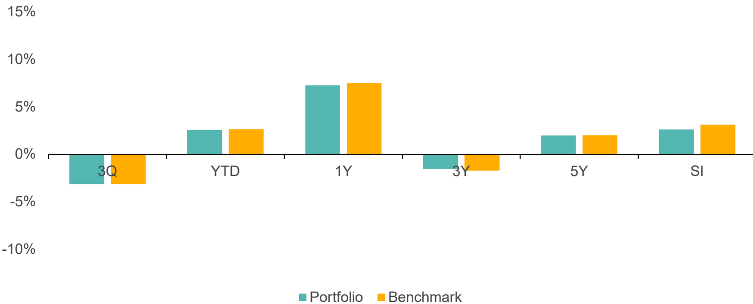
Short-Term Pool Performance