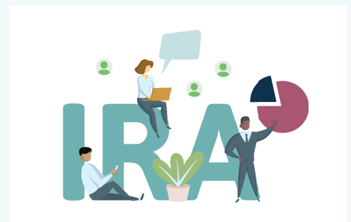
INHERITING AN IRA

GTCF's Philanthropy Team can give you more detailed information about scenarios where a CRT can generate income while achieving your philanthropic impact.